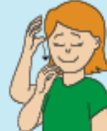
sleep With palm toward face, slide hand down bringing fingers together; close eyes.