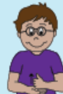
help Place hand on top of palm and move both upwards.