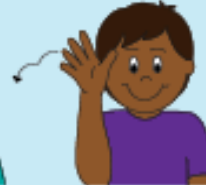
grandpa With open hand at forehead, move palm forward in two small arcs.