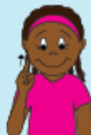
up (carry) Point upwards.