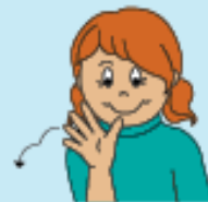
grandma With open hand at chin, move palm forward in two small arcs.